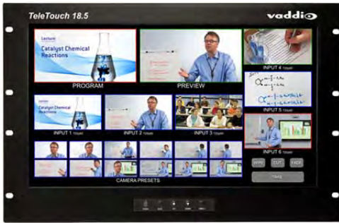
18.5" Rack Mount Multiviewer Touch Screen (P/N 999-5520-185)