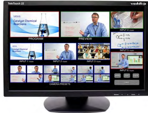
22" Standard Multiviewer Touch Screen w/base (P/N 999-5520-022)