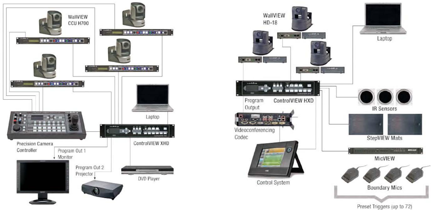
Figure 6 (left), showing ControlVIEW XHD with Precision Camera Controller, HD cameras and a laptop connected. Figure 7 (right), showing ControlVIEW XHD integrated with a videoconference codec, StepVIEW, AutoVIEW IR and MicVIEW triggers.