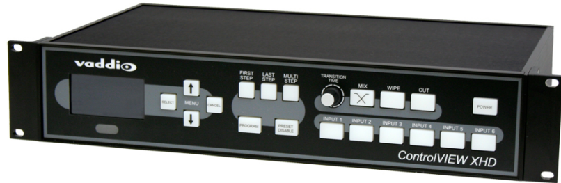
Figure 1: ControlVIEW XHD Camera Control System

Vaddio introduces the ControlVIEW XHD, a multi-input PTZ camera control system designed for a variety of presenter-controlled applications in conjunction with our preset camera trigger devices such as StepVIEW mats, AutoVIEW IR sensors, MicVIEW and TouchVIEW. In addition, the ControlVIEW XHD can be a stand-alone video switcher or used with our Precision Camera Controller.