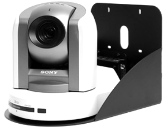
Figure 1: WallVIEW PRO 300 System with Camera, EZIM and Wall Mount

Overall, the WallVIEW PRO 300 is superb for a wide range shooting applications. It is also highly suitable for applications in which images are displayed on large-screen displays, such as in houses of worship, in auditoriums of teaching hospitals, in corporate boardrooms, at sporting events, tradeshow or concerts and for distance-learning applications in which clear, standard definition images are required.