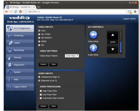
Web Page Example

Made in the USA: The AV Bridge CONFERENCE was designed and is fabricated at the Vaddio headquarters in Minnetonka, Minnesota.