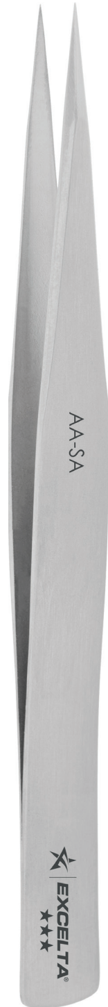
C.T.M. Critical Tip Measurements (Tip Width and Thickness of one point)