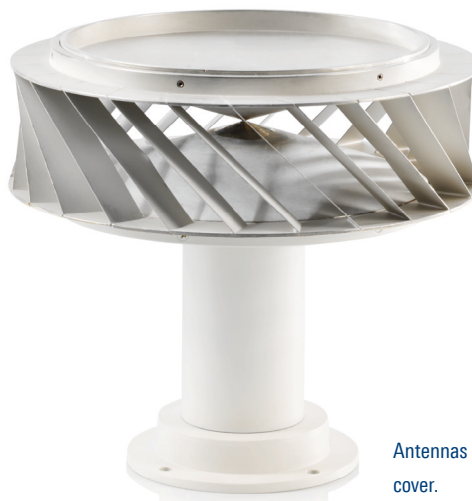
Antennas without weather protection cover.