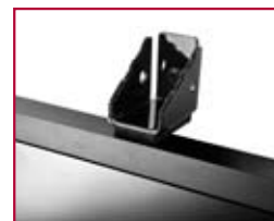
Easily attach accessory to studs with security screw