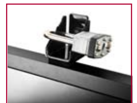
Keyed alike padlocks prevents tampering with security screw by obstructing access to it