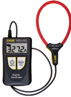
MINIFLEX: 4000D-14 (14" probe)