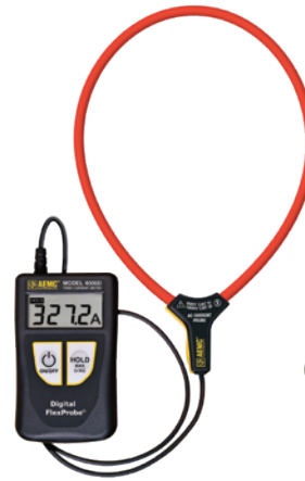
MINIFLEX: 400D-24 (24" probe) 4000D-24 (24" probe) (shown)