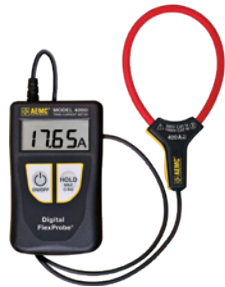
MINIFLEX: 400D-10 (10" probe)

Provide a welcomed solution when accessing electrical conductors in tight places