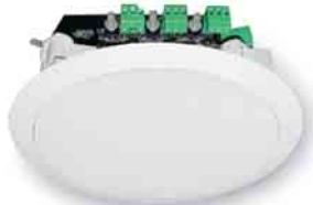
AMPIC5 / AMPIC6 / AMP31C6 / AMP41C6 / AMP1SGRN