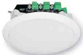
AMPIC5 / AMPIC6 / AMP31C6 / AMP41C6 / AMP1SGRN