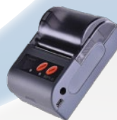
Wireless Bluetooth™ Printer (EE900P)