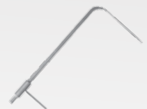
Pitot Tube for Air Velocity (BB610032)