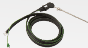
Sampling Probe (E85AACSF13)