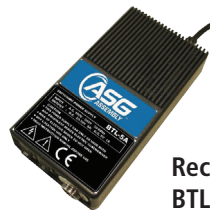
Recommended Power Supply: BTL-5A (ASG #65710)