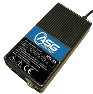
Recommended Power Supply: BTL-5A (65710)