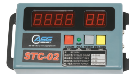
Optional Screw Counter: STC-02 (ASG #65646)