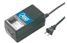
Recommended 110V Power Supply: BTL-2A24 (65708)