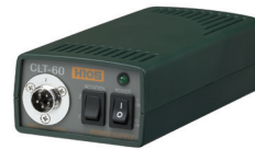
CLT-60 (ASG #65520)