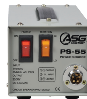
PS-55 (ASG #65700)