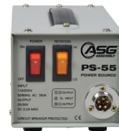
PS-55 (ASG #65700)