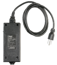
TLB-PS-61 (ASG #68634) For additional images of power supplies, see Section 9