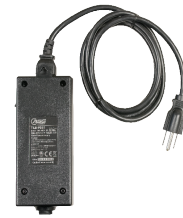
TLB-PS-61 (ASG #68634)