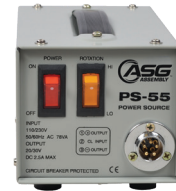
PS-55 (ASG #65700)