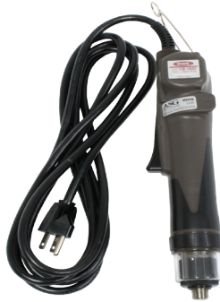
VB-1820 Lever Start