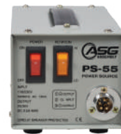
PS-55 (ASG #65700)