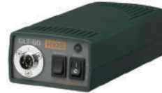
CLT-60 (ASG #65520)