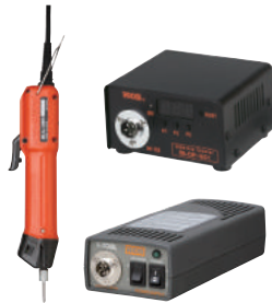
BLG-5000-OPC with BLOP-SC1 Counter and T-70 BL Power Supply