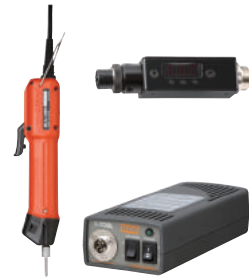
BLG-5000-OPC with BLOP-SC3 Counter and T-70 BL Power Supply