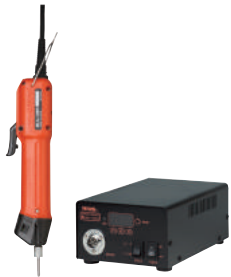
BLG-5000-OPC with BLOP-STC3 Power Supply