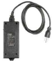
TLB-PS-61 (ASG #68634) For additional images of power supplies, see Section 9