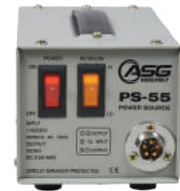
PS-55 (ASG #65700)