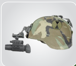
PS15 WITH HELMET MOUNT ASSEMBLY