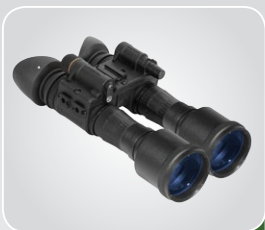
PS15 WITH 3X LENS