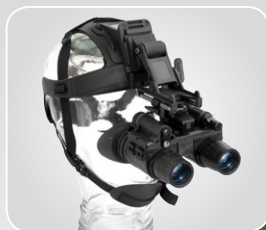
PS15 WITH HEAD MOUNT ASSEMBLY

* Specifications are provided for informational purposes only. Actual values may vary