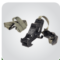
MICH HELMET MOUNT KIT ACGOPS15HMNM