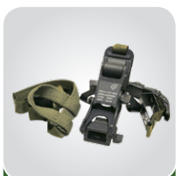
PADST HELMET MOUNT KIT ACGOPS15HMNP