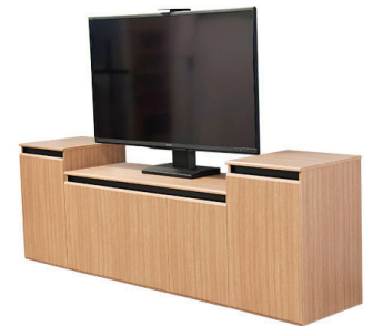
Side by side with CR3000EX (Sold separately) (70" TV shown)