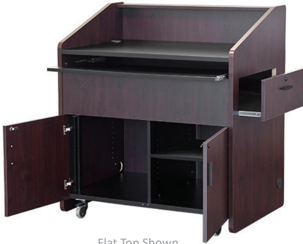
Flat Top Shown

Top rear removable, intended to easily be mounted in a wedge position or as flat large work surface, that can support monitors laptops and room control systems.