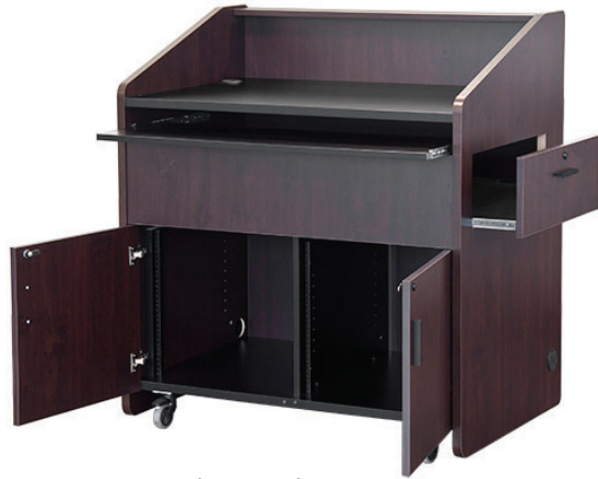
Flat Top Shown

Top rear removable, intended to easily be mounted in a wedge position or as flat large work surface, that can support monitors laptops and room control systems.