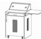
PD5103 Podium 29.75"W x 30"D x 47"H