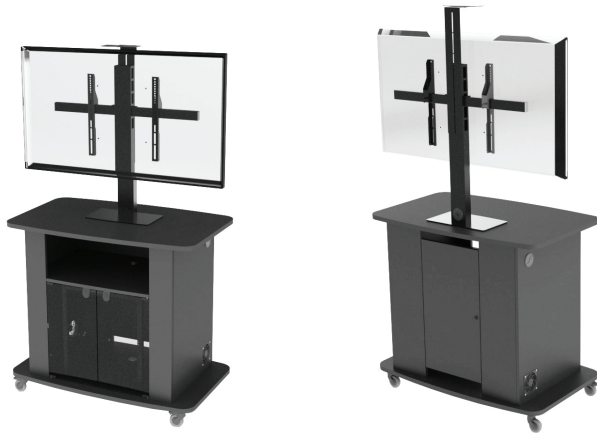
C2736-42 + Optional Single Mount