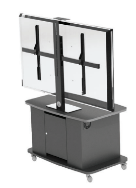
C2736 + Optional Single XL Mount (Rear)

The Tech series monitor cart model C2736 is truly an all-in-one unit that will accommodate single 37" to 60" monitors using the optional PM2-S mount, single XL 60" to 90" monitors using the optional PM2-XL mount or dual 42" to 70" using the optional PM2-D mount. Tech Series carts have a super wide wheel base that provides an extra measure of safety for heavy or oversized monitors, etc.