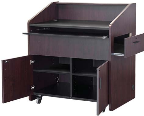
Flat Top Shown

New Feature: Top rear removable, intended to easily be mounted in a wedge position or as flat large work surface, that can support monitors laptops and room control systems.