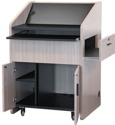
Console Top Shown

Top rear removable, intended to easily be mounted in a wedge position or as flat large work surface, that can support monitors laptops and room control systems.