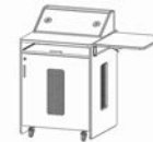
PD5103 Podium 29.75"W x 30"D x 47"H