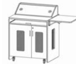
PD51 Mobile Station 36.5"W x 30"D x 47"H