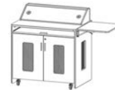
PD5107 Dual Rack Station 42.75"W x 30"D x 47"H