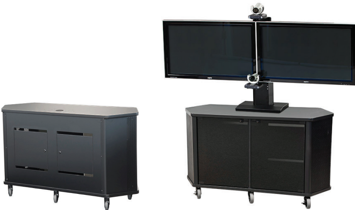
Shown with optional mount (Sold separately)