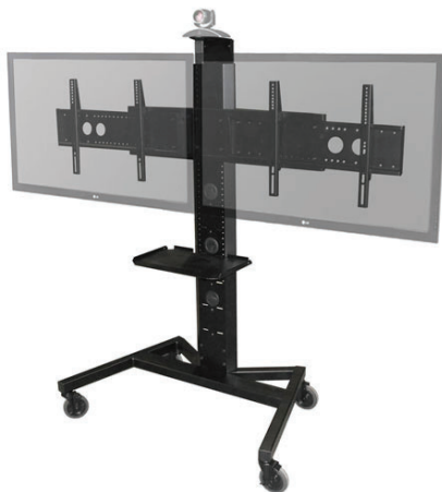
2x 43" TV's shown at table height. 55" max size for this configuration

The PM-XFL is a heavy duty wheeled stand with adjustable 6 position shelf for media players, cable or satellite receiver, video conference codecs or audio amplifier. This mount accommodates single XL or dual displays (265 lbs max).