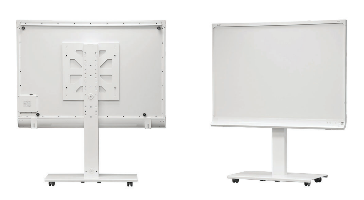
SYZ84-K with *SMART kapp 84® capture board installed

The SYZ84-K economy LCD monitor stand is a solution for a wide range of video conferencing and interactive applications. Its unique modern design plus accessible base shape is ideal for corporate and educational environments. Adjustable display mounting plate and cable passage in spine with grommets both in the top and bottom for passing cables inside the unit, leaving it with a very clean controlled appearance. This unit is available in white & black metal; maximum weight capability 200 lbs.