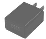
AC Power adapter Output: DC 5V, 2A

The charger comes with a 2m long USB cable, ready to plug into a transformer, computer, or hub.