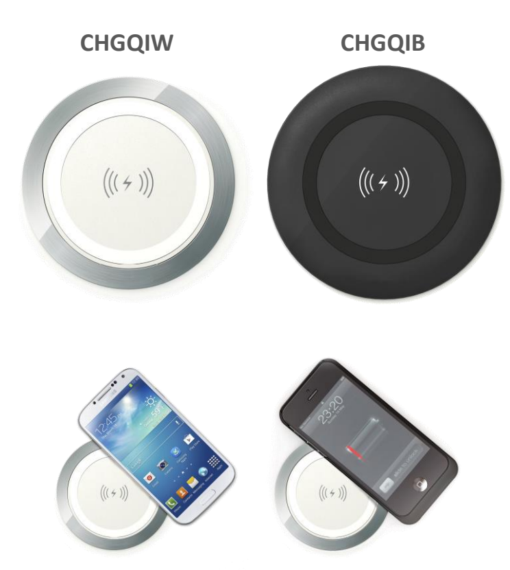
Android and Apple compatible (see <u>compatibility list</u>). *Phones not included