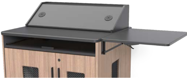
SH-FL-51 installed on PD51 Station (Sold separately)