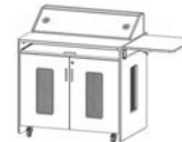
PD5107 Dual Rack Station 42.75"W x 30"D x 47"H