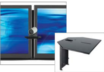
PS-50: 24" - 48" back plate and one shelf. Center camera shelf will only work on "L" carts and mounts. Below camera shelf can be used on RPS & GMP series carts mounted with a 50" or smaller display or will work on wall mounted displays.