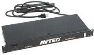
RCK-PWR: Rackmounted power supply with 12-ft power cord