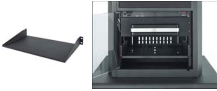
US-1: Accessory shelf, 12 1/2" deep