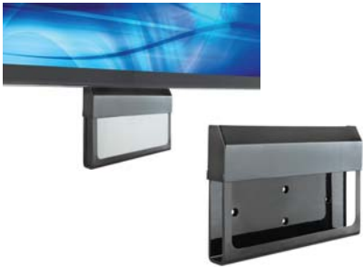
GROUP-WM: Wall mounting kit for Polycom's Group Series 300/500. Similar in appearance to the SX-20.