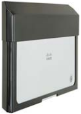
SX-20: Wall mounting kit for Cisco's TelePresence SX20. Black powder coat finish, 3-sided venting and cable-management cover