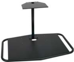
APA: Rear screen mounted, height-adjustable camera mount