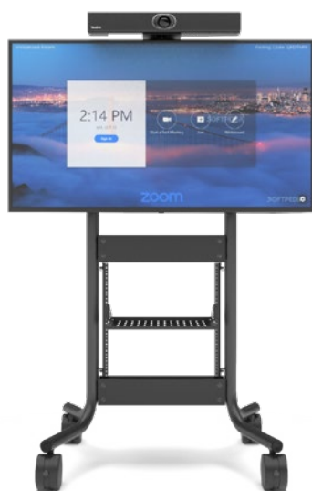
Yealink MeetingBar Mount shown on RPS-500