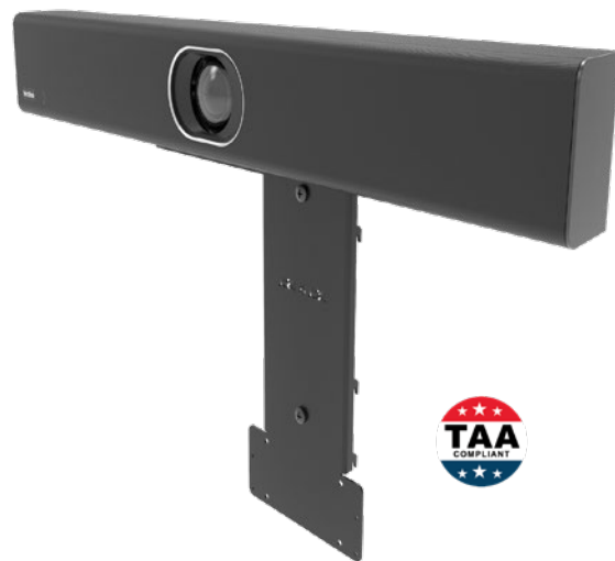
MeetingBar A20/A30 Mount