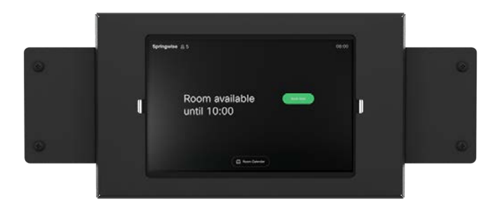
Shown with Cisco Room Navigator