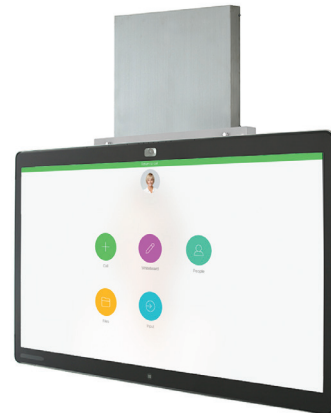
DynamiQ 400 mount with Cisco Spark Board mount kit