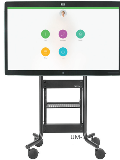
DynamiQ RPS-500 with Cisco Spark Board mount