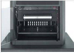
US-1: Accessory shelf, 12 ½" deep