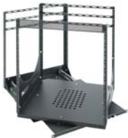
SR-12: Additional sliding rotating rack for 2 & 3 bay Credenzas