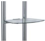
RPS-AS2: 19" accessory shelf for use with RPS-200