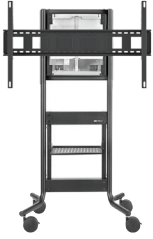
DynamiQ RPS-500 RPS-500-70-CSB