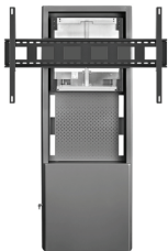
DynamiQ Wall Stand D-WMS-BB-CSB