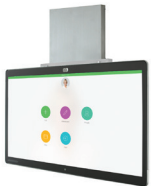
DynamiQ 400 Mount AVT-BB400-70-CSB