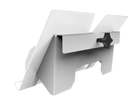
LTAP-MNTKIT review view