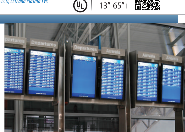
Dedicated Portrait Models