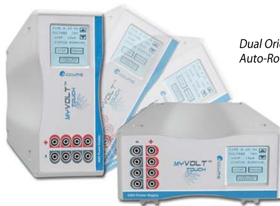
Dual Orientation, Auto-Rotating Display