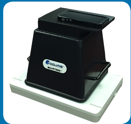
Use with SmartDoc™ for gel imaging with a cell phone