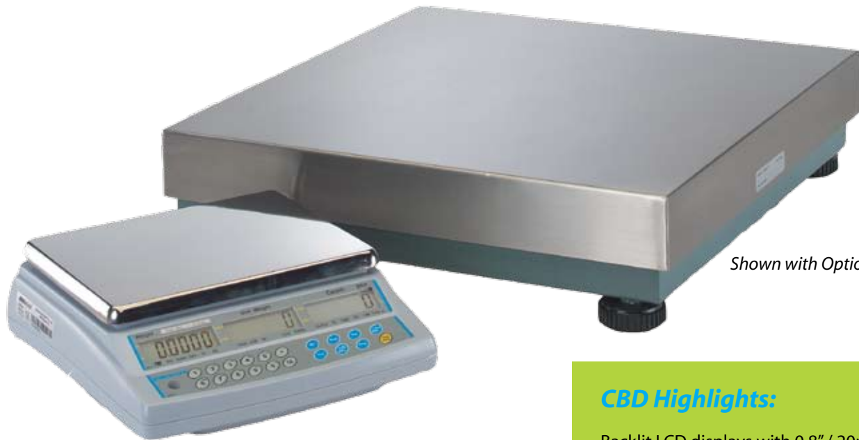
Shown with Optional Base

The CBD offers powerful counting processing in a simple to use and set up scale.