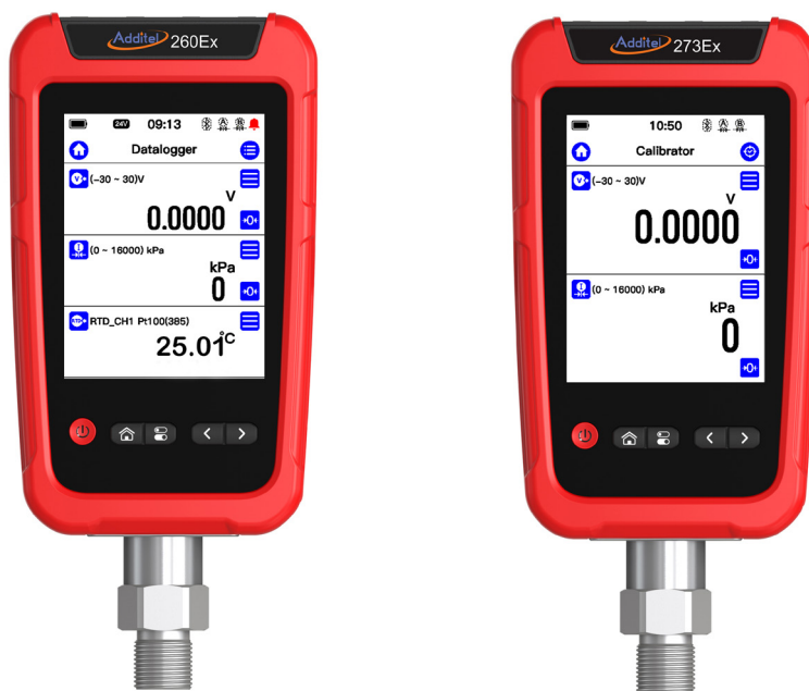
Additel 273Ex and 260Ex with ADT158 pressure module installed