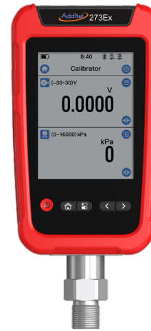
Additel 273Ex with ADT158Ex module