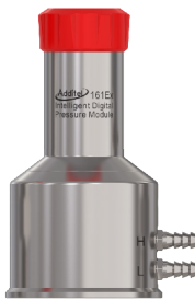
ADT161Ex pressure modules - See ADT161 Datasheet for more info