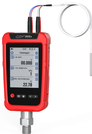
ADT260Ex with AM1602 temperature probe

Note: The ADT260Ex can be purchased without the ADT158Ex module if needed using the following part number: ADT260EX-NO