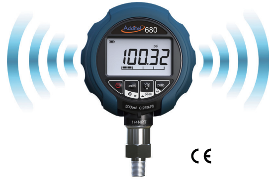
680 with data logging and wireless (optional)