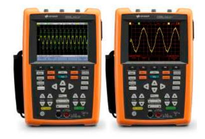
World's first VGA display handheld oscilloscope with two isolated channels