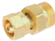
MCT Adapter Part No. 0386-0505