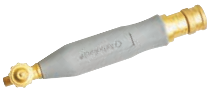
WA-400 Torch Handle Part No. 0386-0410