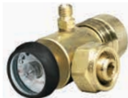
AR-B Regulator Part No. 0386-0725