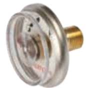
AG-1 Regulator Part No. 0386-1200 (gauge only)