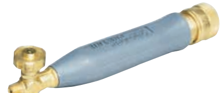
G4 TurboTorch® Torch Handle Part No. 0386-0308