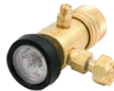
AR-MC Regulator Part No. 0386-0726