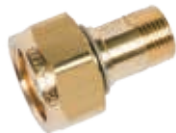
BTMCR Adapter Part No. 0386-0503