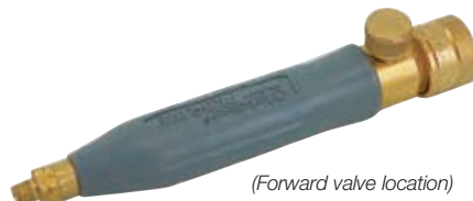
PLF-A5 Proline® Torch Handle Part No. 0386-0872