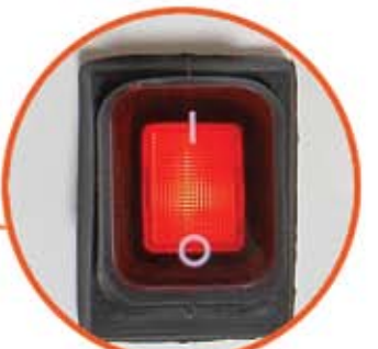
Main Power Switch