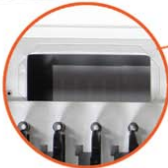
Cable Pass-thru Slots