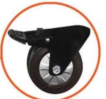
Locking ER Wheels