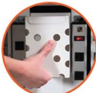
Removable Adapter Baskets