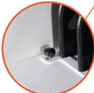
Retaining Strip & Thumbscrews