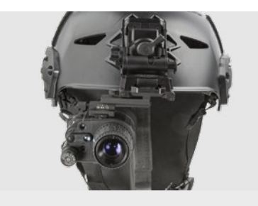
COMPACT AND RUGGED Perfect balance of size and performance