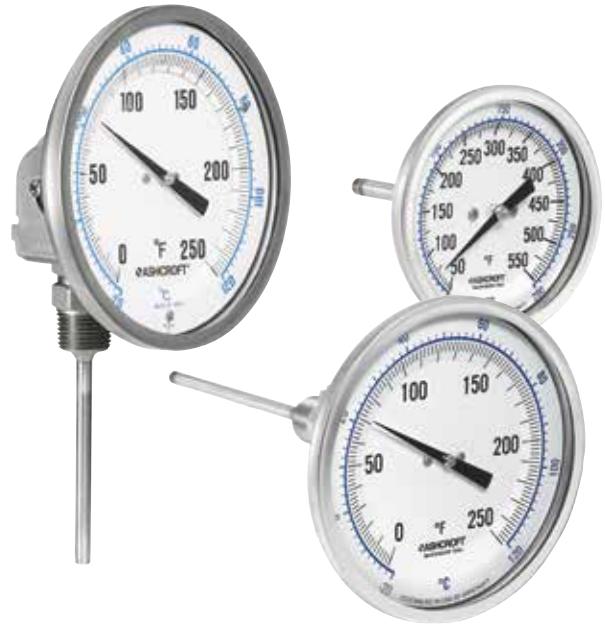
EL Bimetal 3", 5" dial sizes